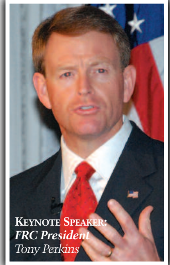
KEYNOTE SPEAKER: FRC President Tony Perkins

A special feature of this year's Partnership Banquet was the inauguration of three annual awards: the Rosa Parks Citizen Activist Award; the John P. Muhlenberg Pastor Leadership Award; and the