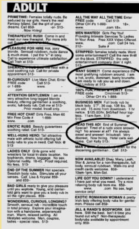
ABOVE: Typical adult classified in CityBeat 's print edition.

"As in the numerous suits filed against us in the past, with the assistance of our friends at the Alliance Defense Fund, we will win by seeing this one, like all the others, through to its successful conclusion. And in the meantime, we will continue to ask the greater Cincinnati community to join us in pleading with CityBeat 's management to eliminate their disgraceful Adult Classified ads." Take Action