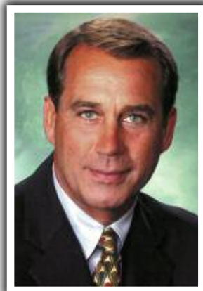
REP. JOHN BOEHNER Standing Firm