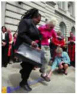
Domestic partners celebrate at Cleveland's City Hall.