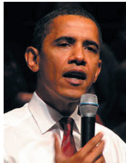
President Obama’s healthcare reform – Rhetoric verses reality

“I said I won’t sign a bill that adds to the deficit or the