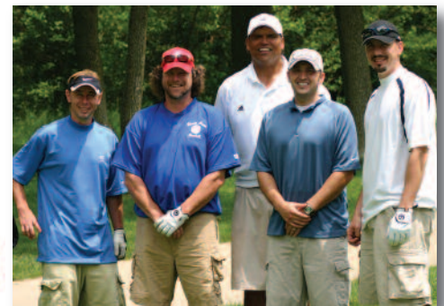
2nd Place – Kings Electric

Our thanks to all who made the 2008 Classic a day of great golf, fellowship, food and fun – in spite of the rain!