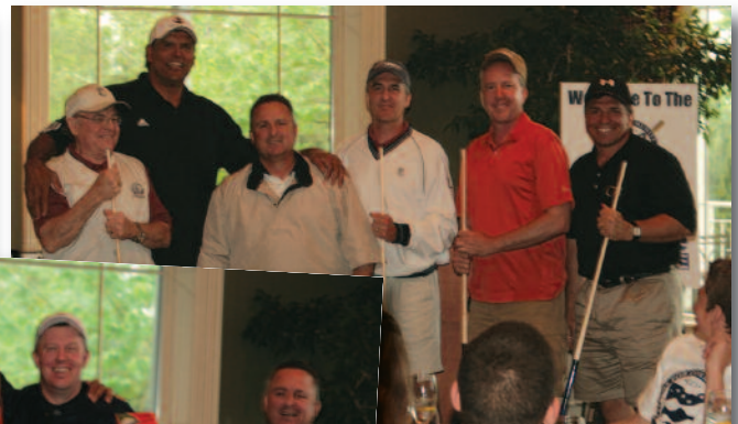
Cue sticks! For the last-place team

A weed eater – ball in the woods competition