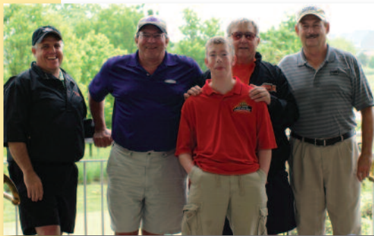
1st Place – The Team from JTM