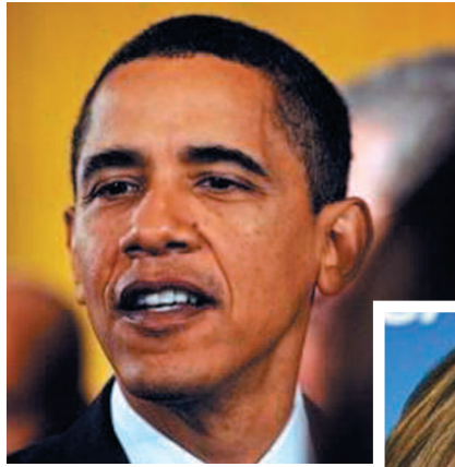
House Majority Leader Nancy Pelosi (D-CA) and President Barack Obama – jubilant after passage of the bill that fast-forwards their anti-family social agenda.

On February 13 the Wall Street Journal reported that the federal agencies that will be responsible for implementing the bill's many programs simply do not have the contracting manpower to manage such an unprecedented explosion of spending. Many of the projects would require environmental impact studies, which alone would require five to eight years to complete under normal circumstances. It would not have been a "catastrophe" to take the time